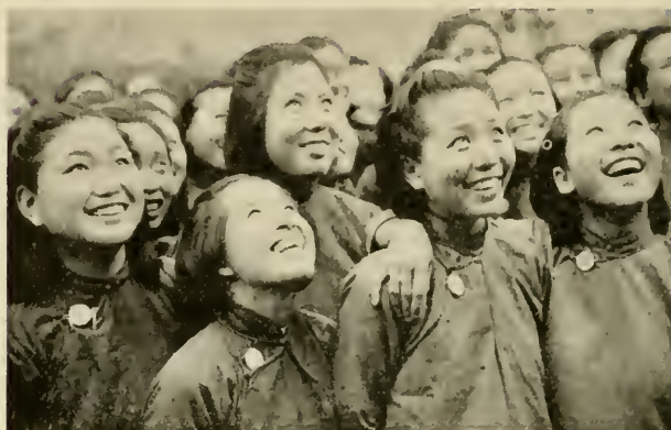
Workers at the Handicraft Center of China's Women's Advisory Council

"There is also a wide and deep appreciation of what the Christian movement has done for modern progress in China. Dr. H. H. Kung has voiced the sentiment of the Chinese people with regard to the service rendered by the Christian church in China in the fields of education, science, medicine, and philanthropy. For these individual services," Dr. Kung said, "many have come from the Western countries to work in our land in the spirit of Christian fellowship and service. They have shown the greatest courage, energy, and self-sacrificing spirit, especially in this time of trial and tribulation, trying to care for the sick and wounded, to relieve refugees and war sufferers, and to protect the innocent. Their spirit cannot but arouse admiration among our people and make them appreciate the cause for which these missionaries are ready to live and even to die."